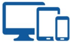
Computer & Internet Basics