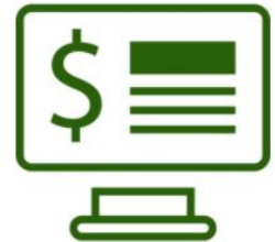
Managing Finances Online