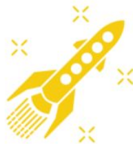
Online Job Resources