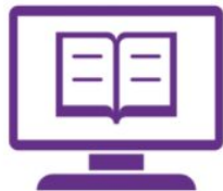
Online Learning Resources